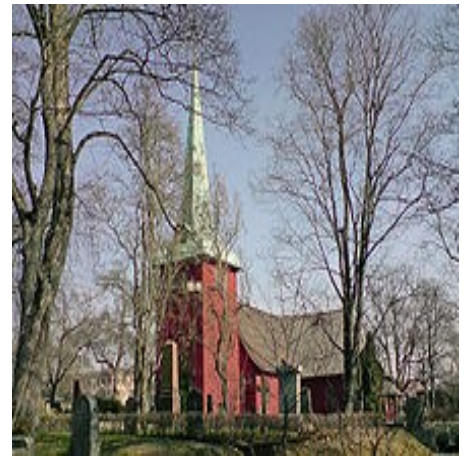
The church of the city Karlskoga with its well-known red wood which makes it an eye-catcher for sure.