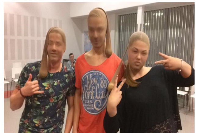
A game where you had to knock over bottles with a panty and tennis ball. Fun guaranteed.

A game based on question that we had to answer first. Like who is good at pulling silly faces? Then we had to do them to find out who really was the best at the challenge.