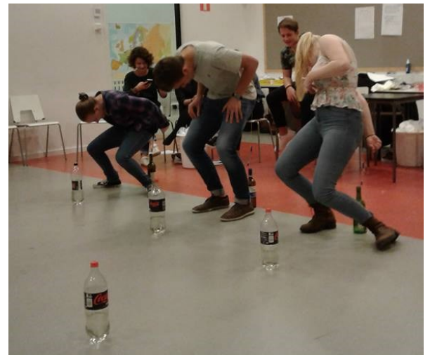
Trying to put the pen into bottles as fast as you possible can to win this race