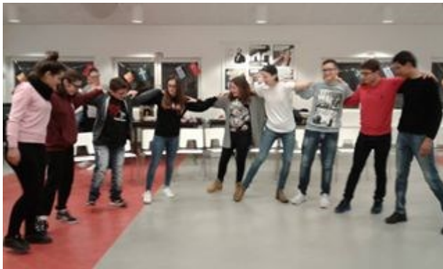
Learning a Greek dance